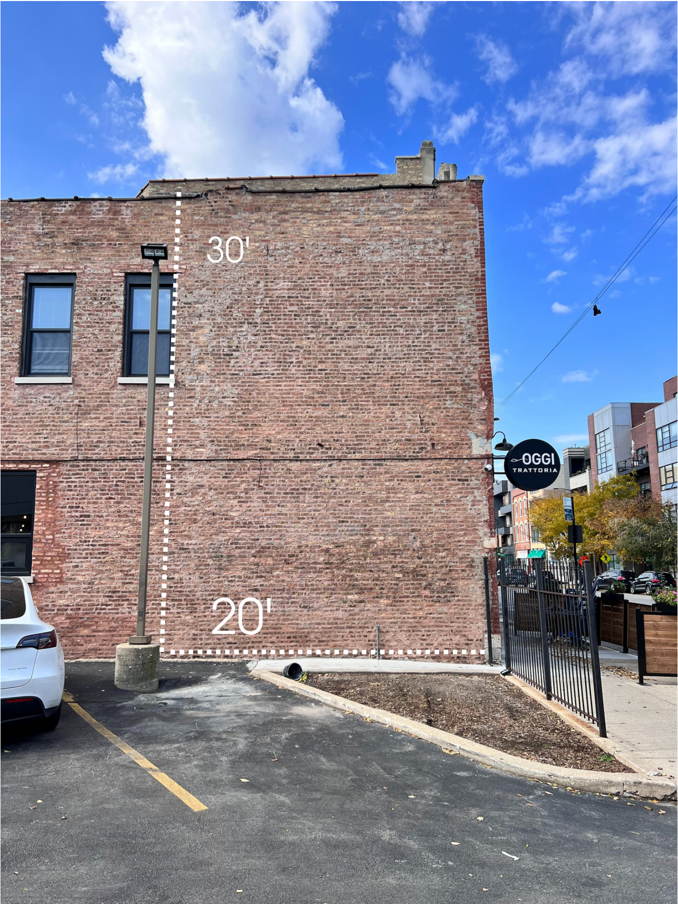
Figure 2: 1461 W. Chicago