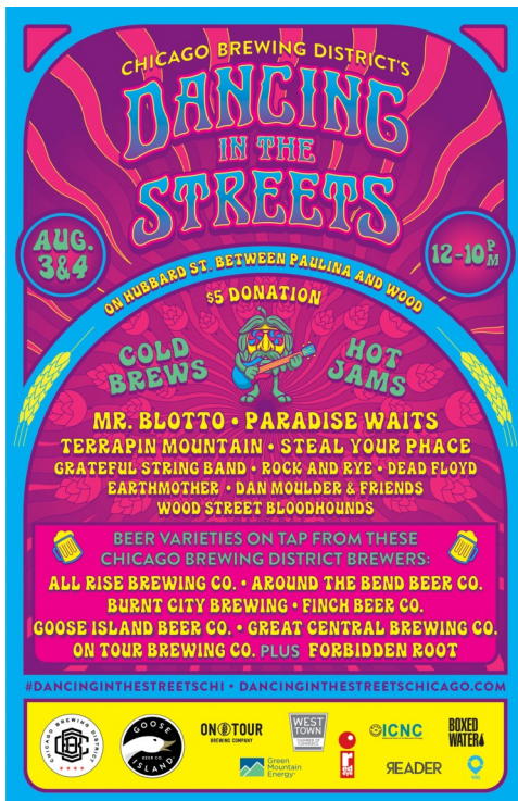
11 x 17 Poster