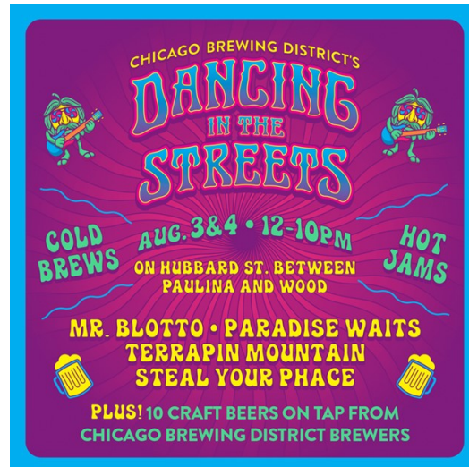
Reader Digital Ad with weblink