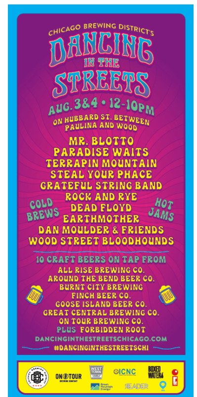
Half Page Red Eye Ad